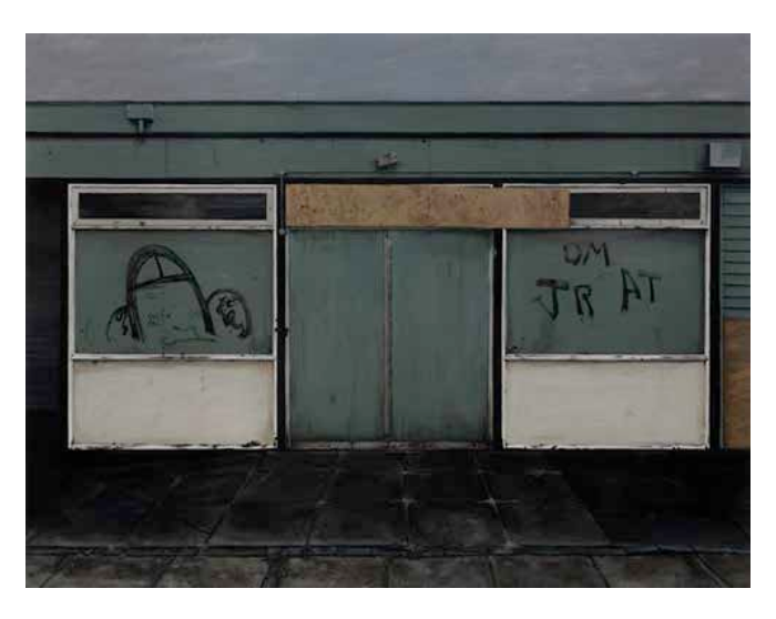
George Shaw, The Back that used to be the Front, Humbrol enamel on board, 2008

The wastelands have sense of freedom and can be somewhat lawless of the confines of our day-to-day existence. Farley and Symmons Roberts (2012) suggest it "opens up great possibilities for all kinds of licit and illicit pastimes, including the infamous trio – sex drugs and rock'n'roll." (Farley & Symmon Roberts, 2012, pg151). This notion of the wasteland being an escapism and lawless is also dramatised in much of popular culture for example the film (Chappie, 2015) or even art exhibitions (Don't Follow the Wind, 2016).